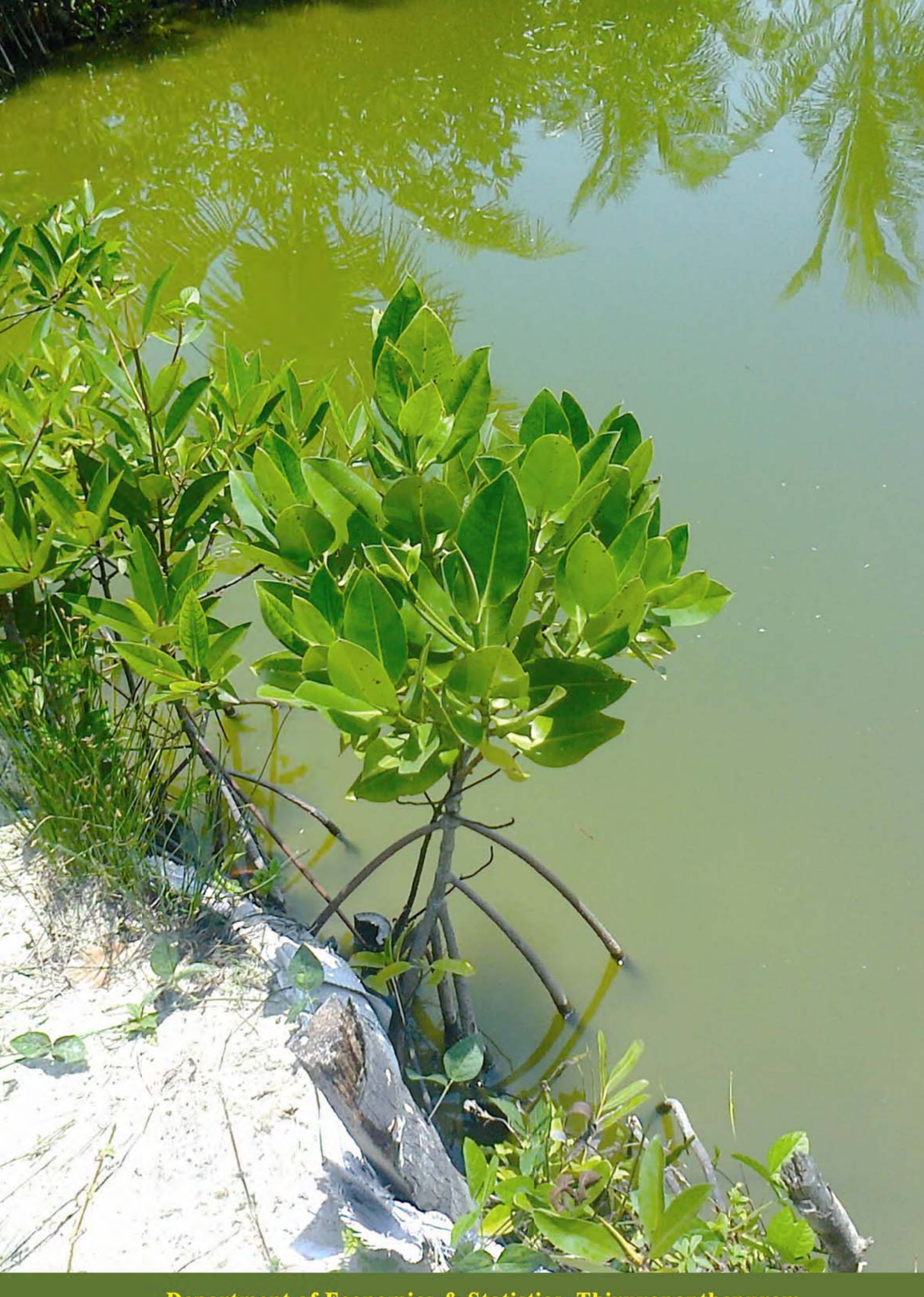
Department of Economics & Statistics, Thiruvananthapuram